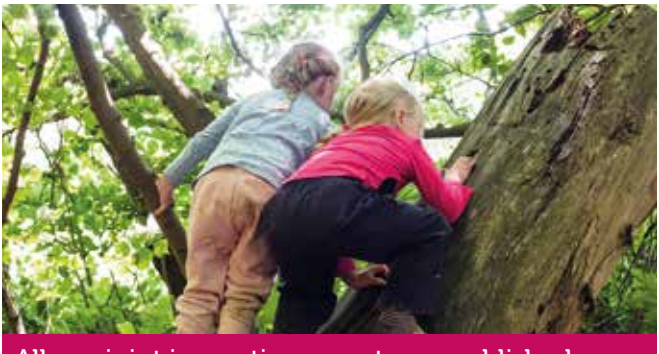
All our joint inspection reports are published on our website at

These inspections, which we sometimes carry out jointly with other scrutiny bodies, look at services for particular groups of people. For example, children and young people, adults and older people, and community justice.